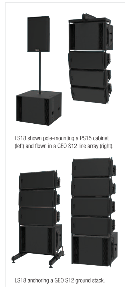
LS18 shown pole-mounting a PS15 cabinet (left) and flown in a GEO S12 line array (right).

Light and easy-to-handle, the LS18 uses a single 18" long excursion driver and is compatible with all GEO S12 accessories, so it can fly with the S1230 and S1210 line array modules, or anchor a ground stack of S12 cabinets. With a steel stand fitting on top of the cabinet, the LS18 also allows for pole mounting of GEO S12 cabinets or NEXO PS15-R2 full-range speakers. LS18 can be flown in tandem with PS15s, which will be of particular interest to the installation sector.